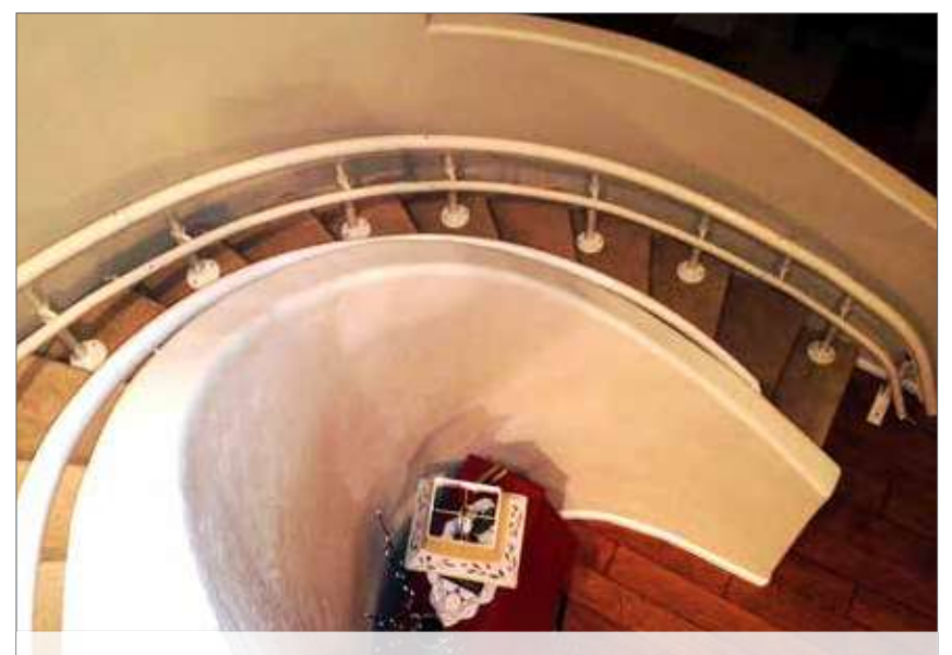
Beige rail with long sweeping turn on the wall side of the stairs