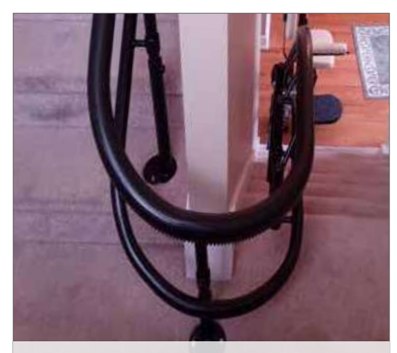
Black rail with tight 180° turn on the inside wall of stairs