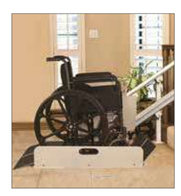
Incline Platform Lifts