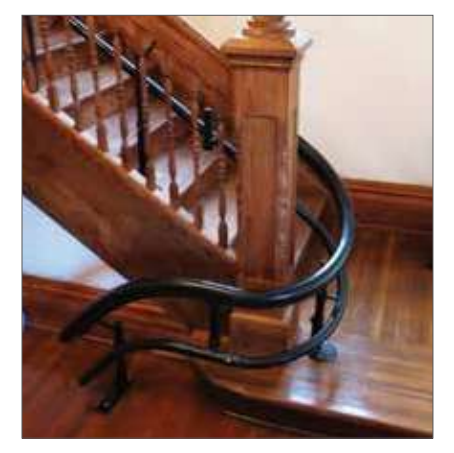
Top and Bottom Landings