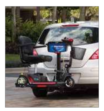
Multiple auto lift solutions for wheelchair or scooter