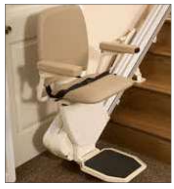
Straight Stair Lifts