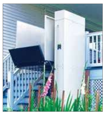
Vertical Platform Lifts