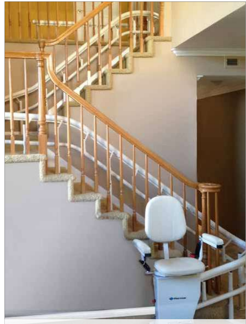
Beige rail with wide 180° turn the landing of the banister side of stairs